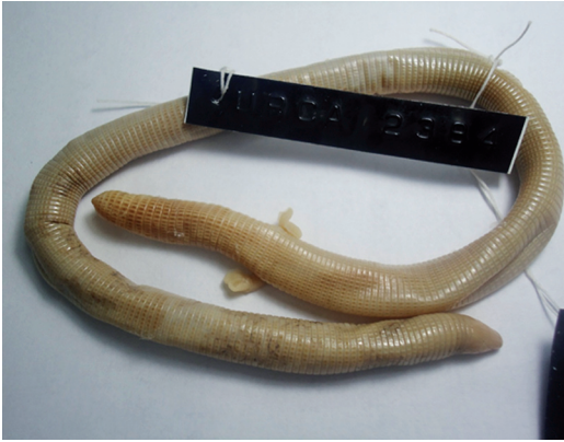
Figure 2. Specimen of Amphisbaena ibijara (URCA-H 2384) collected in Timon, state of Maranhão, Northern Brazil.

from the type locality (Rodrigues et al. 2003; Fig. 1). The voucher specimen is housed at the Coleção Herpetológica da Universidade Regional do Cariri, Crato, Ceará (URCA-H 2384).