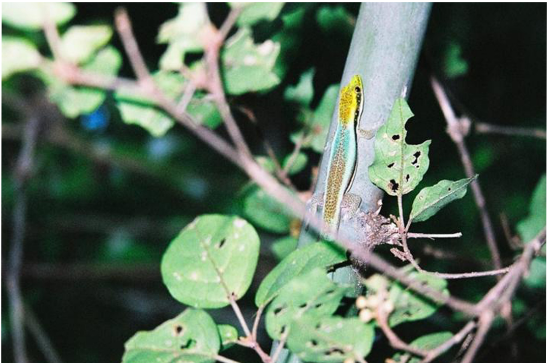
Figure 2. Phelsuma klemmeri found in the bamboo forest at Antsakoamalinka, western Madagascar.

These two day geckos were identified as Phelsuma klemmeri by their small size with a colorful yellow to orange head and neck, anterior back bluish and posterior brown with one light turquoise dorsolateral band, below one dark lateral band, and several white dorsal spots on hind legs. The tail was turquoise in both individuals (see Fig. 2). No tissue samples or specimens were collected. These two P. klemmeri were sympatric with P. kochi and P. mutabilis , but did not occupy the same microhabitat.