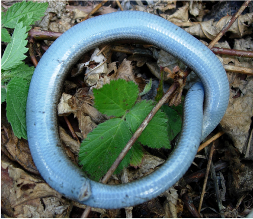
Figure 2. Blue colour of ventral body part of the male A. c. incerta .