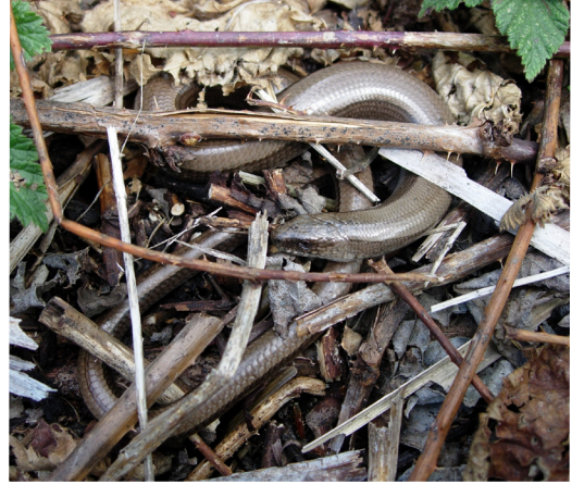
Figure 3. View to dorsal parts of the identical specimen.

Its lateral body part was also dark brown. Only after catching and handling with the specimen by the author, in order to take detailed photographs, it was noticed, took note of and photographically documented distinct blue colour of ventral body part starting from the head and ending at the apex of its tail. This ventral blue colour almost precisely copied the ventral and subcaudal scales and gently overlapped to the dorsal scales (Fig. 2).