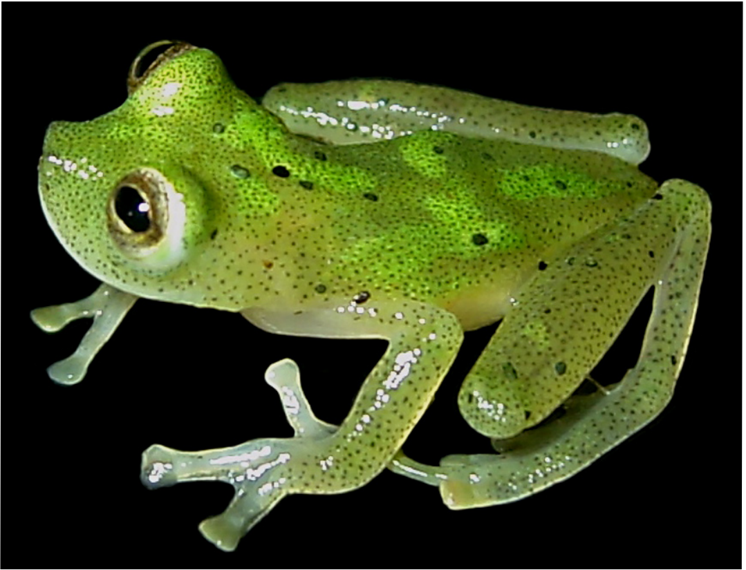
Figure 1. Hyalinobatrachium iaspidiense (DHMECN 04033) from the Cofán-Dureno territory, province of Sucumbíos, Republic of Ecuador.