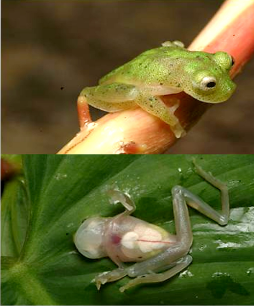
Figure 2. Hyalinobatrachium iaspidiense (MZUNAP 0517) from Lago Preto-Paredón, department of Loreto, Republic of Peru.

that H. nouraguensis and H. iaspidiense differed in the condition of iridophores over the pericardium, but a closer inspection showed that these differences are preservation artefacts rather than valid intraspecific differences (Lescure and Marty, 2000; Señaris and Ayarzagüena, 2005; G. Rivas pers. comm.; S. Castroviejo-Fisher pers. comm.). Cisneros-Heredia and McDiarmid (2007) hypothesized that species with large dorsal blotches of iridophores form a monophyletic group but were uncertain about the relationships of this group regarding other Hyalinobatrachium . We agree with this hypothesis and consider that H. iaspidiense and H. mesai form a monophyletic group supported by the synapomorphy of blotches of iridophores on the dorsal parietal peritoneum.